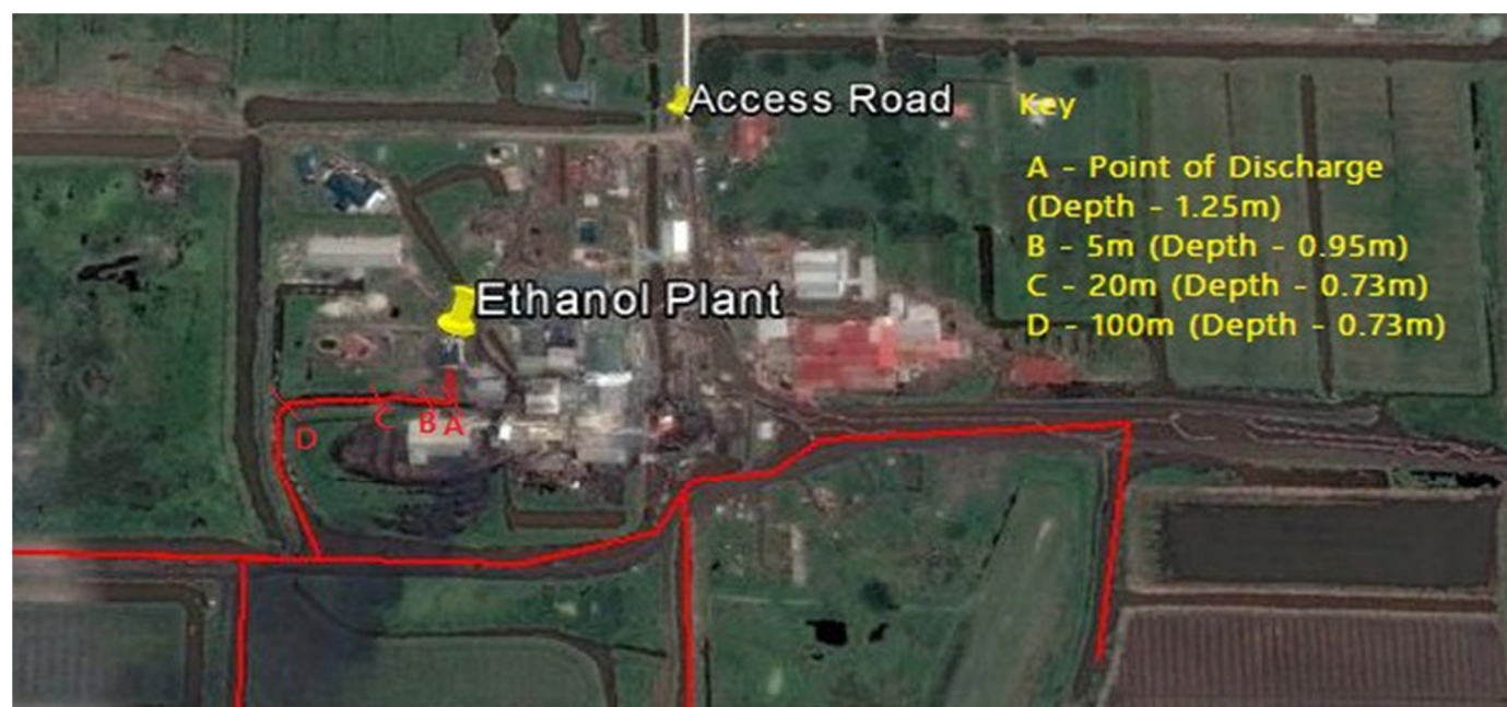
Figure 1: Layout of the Albion Bioethanol Plant with the Sampling Points and Varying Depth Readings